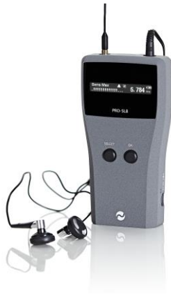
PRO-SL8 with earphones