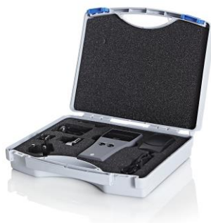
Protective Carry case